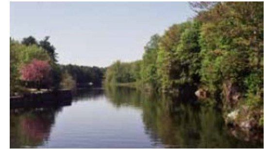
The Contoocook River played a large part in Penacook's history and is still scenic today.