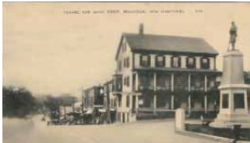
Postcard of the Village of Penacook

Penacook provides all the comforts and necessities one expects in a town – schools, doctor and dentist offices, a library, parks, shops and restaurants. But in Penacook, you can also walk past a dairy farm where cows graze in view of the Merrimack River. Or pass houses built before 1815. Or stroll downtown, greeted by a friendly “hello.” Penacook is a friendly, quaint place to live, work, and visit.