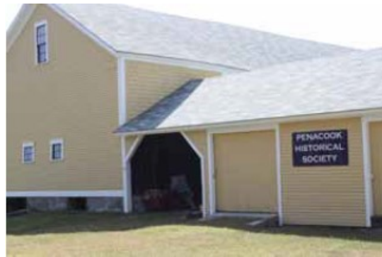
The Penacook Historical Society's 1790's Rolfe Barn recalls a rural age of farms & saw mills

Located along the Contoocook River which drops 100 feet in slightly over a mile, our community grew along both sides of the Contoocook just before it joins the Merrimack River.