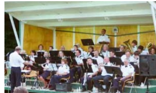
Concerts at Rolfe Parks